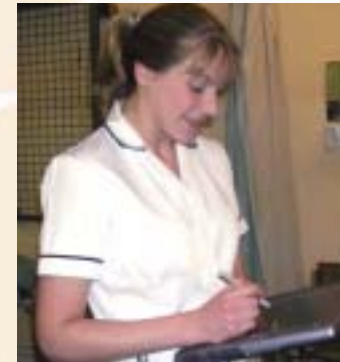
Move with the times: tablet PCs enable therapists to add clinical info to electronic records wherever they are

Imagine it's 2010. By this time, the government says, the NHS will be a more streamlined, open organisation with patients having far greater access to information, able to view their healthcare records via the internet. What's more healthcare professionals will be able to access and share information, enabling them to analyse NHS use or produce risk predictions systems for primary care trusts. The result? Delivering services more effectively than ever before as they are designed to meet the clients' needs.